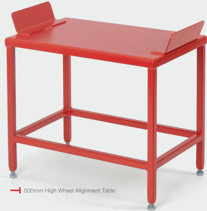
— 500mm High Wheel Alignment Table