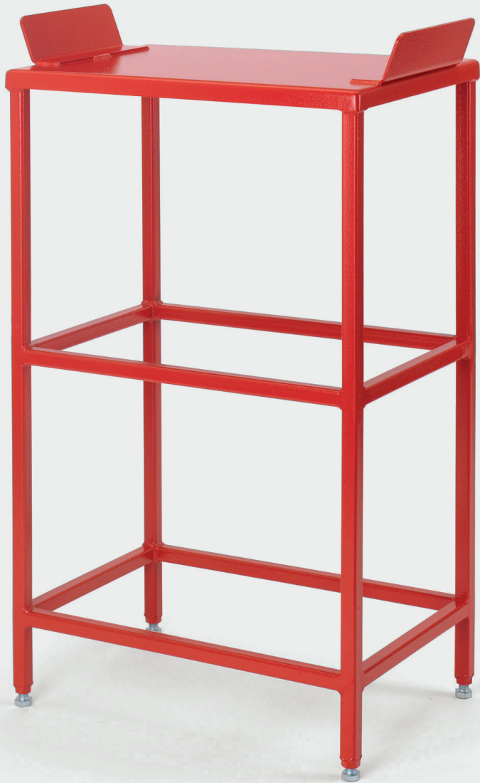
— 1000mm High Wheel Alignment Table